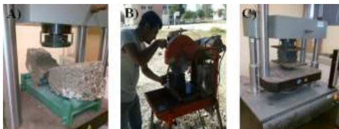
Figure 5. A) Test of bending strength, B) Cutting beams and C) Test compressive strength