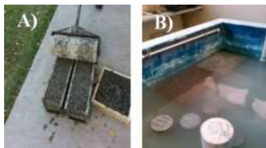
Figure 4. A) Casting mixtures y B) Immersion curing chamber.

After 28 days of curing, the beams were subjected to the test of resistance to bending (M. R, ASTM C293), applying a