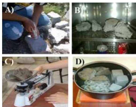
Figure 2. A) Configuration indirect compression resistance by rebound index, B), C) y D) This pictures shows some of the work done in the ASTM C642 standard.

A concrete slabs residue (CO, source of RAC) tests were performed rebound index (Figure 2A) following Mexican standard NMX-C-192 to determine its hardness and induce compressive strength, their porosity, absorption dry and density (ASTM C642). The figure shows some of the works made for these tests, such as the drying in oven, the wet weight and the water saturation.