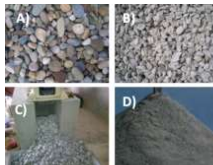
Figure 1. Materials utilized A) RNA, B) NCA, C) RAC y D) SF.

The Silica Fume (see Figure 1D) was provided by the Research Center for Advanced Materials (CIMAV) of the city of Chihuahua, Mexico, which was physically and chemically characterized for the purpose of compare the known properties by reviewing the literature.