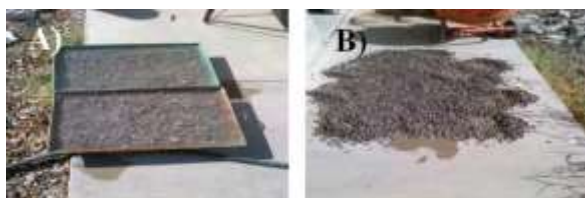
Figure 3. A) RAC in saturation process and B) Drying surface of RAC.

Prior to the kneading process, the recycled aggregate was immersed in water for 10 minutes and then to saturate, this is dried superficially to saturate and prevent water affect the design of the cement paste (see Figure 3). Each of the concrete mixtures were deposited into two beams molds of 15x15x50 cm and compacted with a roller weighing 115 kg (see Figure 4A), and then were protected for 24 hours by plastic cover to avoid moisture loss by last they were demolded and placed in a chamber for 28 days immersion (Figure 4B).