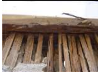
(c) Bamboo strips in vertical direction