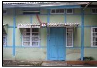
(a) Front View of the House