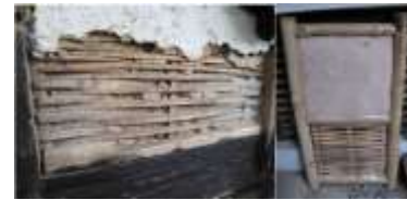
(b) Panel plastered with mud and lime