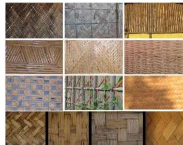
Figure 2. Exposed Bamboo wall design variety

Bamboo is pliable, hollow and lightweight which makes it relatively easy to strip into long horizontal pieces. It can made into strips using sharp knife like machete or khurkuri (local name). In thin wall round bamboo, crushing strength under transverse load is pretty weak. When transverse compressive load is applied the geometry of the material is destroyed, but the actual failure does not happen [5]. In other words, the strips do not easily fail. Strips can withstand considerable tensile and compressive load across the grain. Therefore strips have been used for their strength for since ancient times. The modern laminated bamboo sheets are made by gluing many