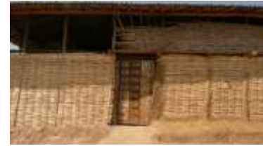
(a) Wall in Construction

are woven into walls as in-fills for timber framed house. The infill were plastered with mud on either side and the outside was washed with lime. The reason being, when it is plastered