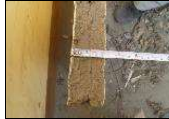
(f) Width of Bamcrete Panel