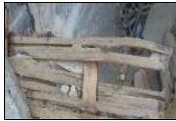
(e) Panels with thin skinned strip