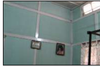
(b) Internal View of the Bamcrete Walls