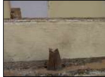
(d) Extended strips in horizontal direction