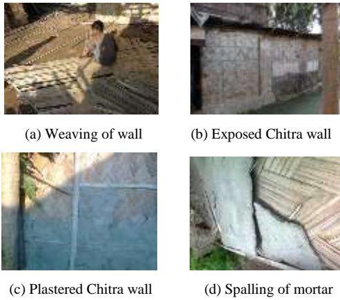
Figure 3. Use of Chitra Wall