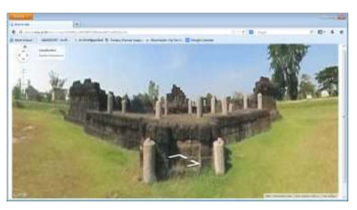
Figure 5. The interactive representation system of Pagoda

However, the difference between other street views is that the Pagoda is not allowing driving the car within the place, then this research using the human to collect the frame and draw the map of connection between frames. The interactive representation system is shown in Figure 5.