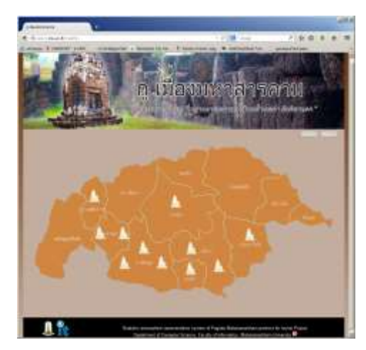
Figure 3. Interactive Pagoda Main Page

The interactive tour is developed using Google Street View Image API [8]. The Google Street View Image API is the free of charge, but the developer must be register the Google account. The Google Street View API is able to display in panoramic 360-degree view. However, the developer must consider in the location and relation between frame and set the right markers within Street view. The markers is the arrow or other sign that is the direction between frame.