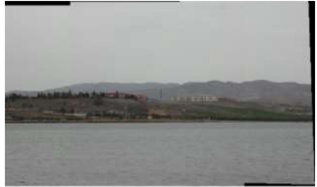
Figure 2. Final mosaiced image

The final step is to blend the colour pixels in the overlapped region to avoid the seams. Simplest available form is to use feathering, which uses weighted averaging colour values to blend the overlapping pixels. An alpha factor is generally used, which is often called alpha channel. It takes the value of 1 at the center pixel and becomes 0 after decreasing linearly to the border pixels. In case at least two images overlap in an output mosaic we will use the alpha values to compute the colour at a pixel in there [8]. An example image mosaicing result is illustrated in Figure 2.