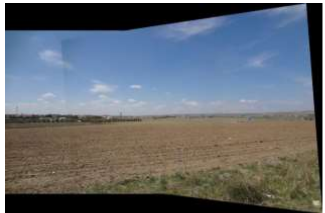
Figure 5. An example of unsuccessful blending (image set#9)