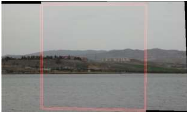
Figure 3. Overlapping region boundary and a 1 pixel wide zone