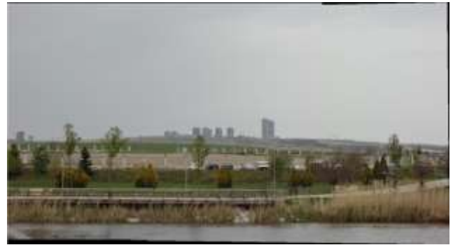
Figure 4. An example of successful blending (image set#1)