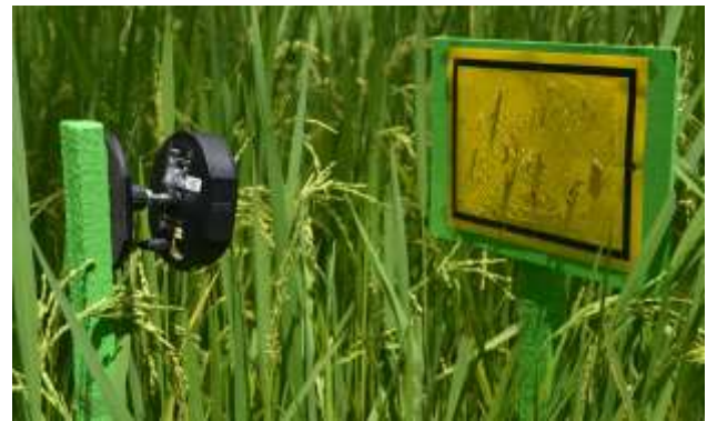
Figure 2. Video recording using wireless camera

The task of the proposed automated pest identification system is performed by a video recorded from camera at 320 × 240 frame size shown in Fig. 2. In this study, a lower frame size was used to lessen the memory during the calculation of the obtained images that easily observes the trapped insect in each frame. The converted video frames are separated into individual frame and saved as in true colour Red Green Blue (RGB) format. First, the images are in RGB format at 320x240 Pixels and later pre-processed and converted into grey-scale images. The converted images are not suitable for feature extraction because sometimes they are affected by various factors such as noise, different lighting variations caused by different weather conditions and poor resolutions of images. A filtering technique was used to filter the images to make it more presentable.