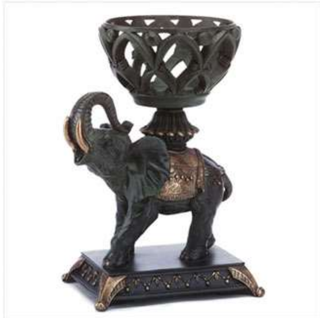
Figure 3. A complex elephant-shaped candle holder suitable for representation by 3D modeling.

3D Computer Graphics has become interesting an interesting field of study and application the world over because it can represent the complex information of certain artifacts (see Figure 3). 3D modeling is used in environmental design and is applied in many technical and scientific fields — for example, in medical imaging techniques (which give physicians a “more real” look inside the body) and in the study of artifacts in that cultural heritage 3D models can protect and study history [4].