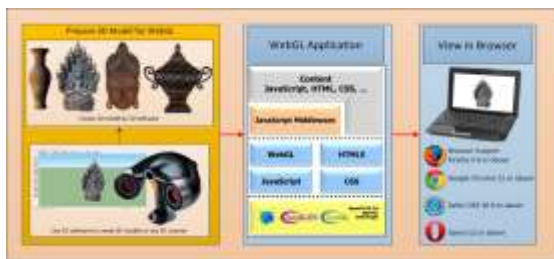
Figure 5. Preparing the 3D contents and viewing the models by using WebGL.

Figure 5. shows that the development tools used in preparing 3D models for WebGL can be of various types such as Google SketchUp, 3D Max Studio, and 3D scanner. For simple models with low polygon, it is better to use 3D software. For complicated models with many polygons, it is better to use 3D scanners for better results and better models. For using a 3D scanner to digitize cultural artifacts, the producer is required to have experience in 3D technology in order to understand the know-how of developing the 3D model. Before using the 3D