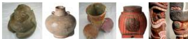
Figure 2: Examples of cultural artifacts.