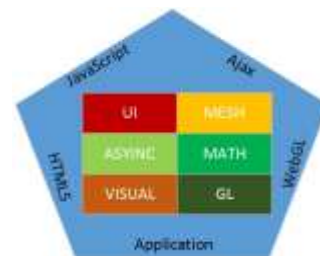
Figure 4: An example of WebGL libraries.