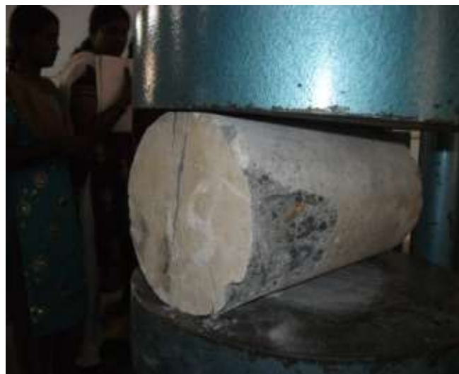
Figure 5 Variation of split tensile strength at different ages

Three specimens of cylindrical shape of diameter 150 mm and length 300 mm were tested under a compression testing machine of 2000 KN capacity under a compressive load across the diameter along its length till the cylinder splits (Figure 5). Split tensile strength of concrete cubes was measured at the age of 7 and 28 days. The tension develops in a direction at right angles to the line of action of the applied load.