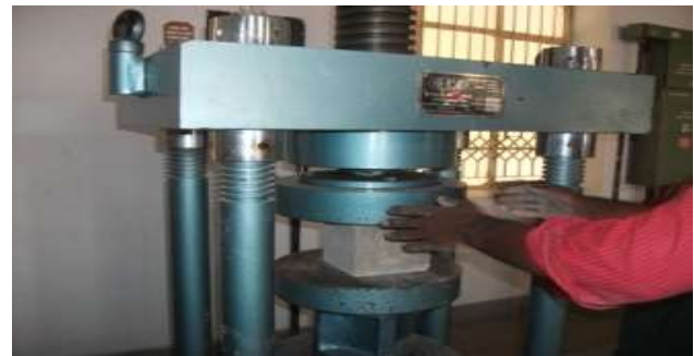
Figure 3 Compressive strength test