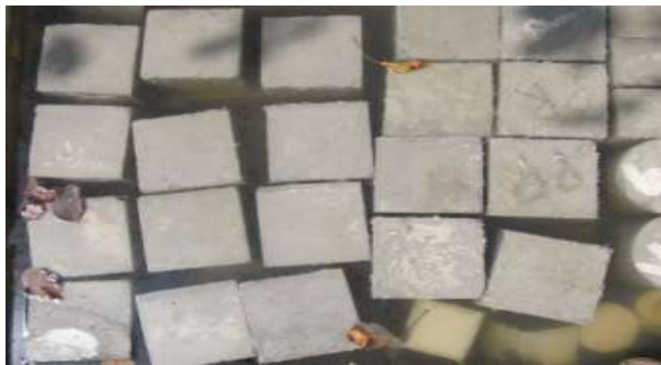
Figure 2 Curing of specimens