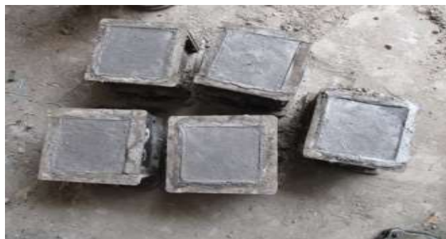
Figure 1 Casting of specimens

Casting: For compressive strength test, cube specimens of dimensions 150 mm × 150 mm × 150 mm were cast using M40 grade of concrete with 1% of recron3s fiber, 1% of Polypropylene fiber and 1% of hybrid [Polypropylene and Recron3s] fiber by volume of cement, separately. Vibration was given to the moulds using table vibrator. The top surface of the specimen was leveled and finished. After 24 hours, the specimens were demoulded and transferred to curing tank wherein they were allowed to cure for 7 days, 14 days and 28 days. After 7, 14 and 28 days of curing, these cubes were tested on compression testing machine. The failure load was noted. In each category, three cubes were tested and their average value is reported.