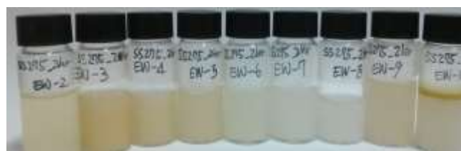
Figure 3. Extraction water of contaminated soil D (collect samples in every 10mins after 40min).

Over 70% recovery was found at both lab- and pilot-scale experiments when operated at 275 °C for soil D and F. Most effective conditions for diesel extraction and recovery recommended were 275 °C and static-dynamic extraction.