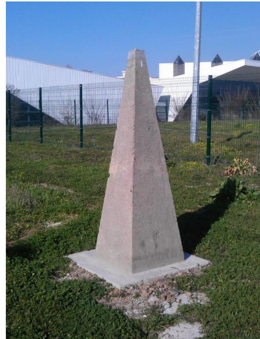
Figure 3. A monument from calibration network in ITU Ayazaga Campus.

number 2 and oriented to the monument number one, azimuth and elevation angles of the obstacles such as trees and electricity poles were measured according to this point. In Fig. 5 obstacles around the antenna calibration area in ITU Ayazaga Campus was illustrated.