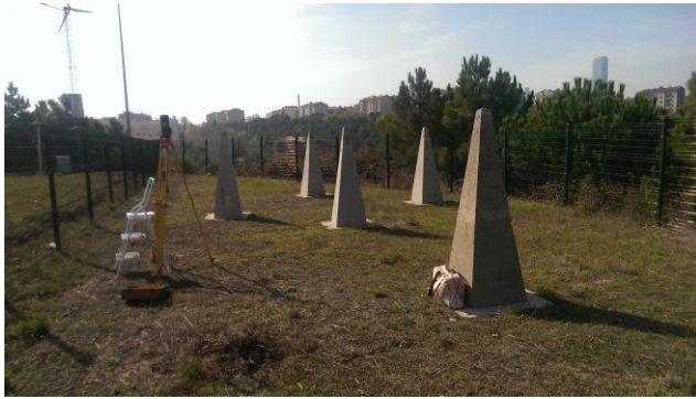
Figure 2. ITU Ayazaga Campus Antenna Calibration Network.