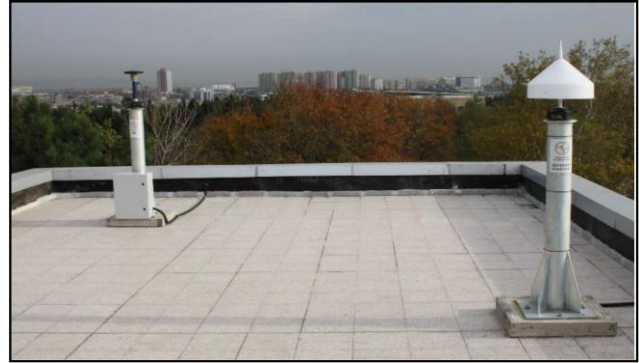
Figure 1. YTU antenna calibration test area [12].

investigated [10]. Another study in Turkey is in Yıldız Technical University (YTU), Davutpasa Campus. An antenna calibration test area was built on the roof of Civil Engineering Faculty. A research team has performed a study to determine antenna phase center and its variations [11]. In Fig. 1 calibration stations in YTU can be seen.