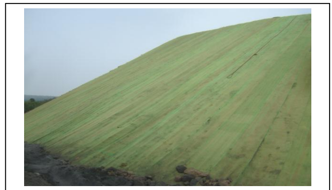
Fig.2. View of the slope of waste dump after covering with soil and blanketing with coir-mat.

Grass-legume seeds consisting of P. pedicellatum , S. hamata , C. juncea and S. sesban , H. sabdariffa (high biomass yielding non-leguminous under shrub) were used for the revegetation of slopes of the waste dump. As slope was very steep, initially covered with coir-mat, then topsoil was spread over it to create a substratum for germination and growth of seeds. Three rows of tillers of Cymbopogon citratus were planted along the berm (edge) of the dump. Additionally, one row of Azadirachata indica seeds was sown at a spacing 3 m interval on the berm. All these activities were carried out before the onset of monsoon to protect the soil and seed mixture from erosion. Seed germination test for grass-legume mixture was conducted in the laboratory controlled conditions to test the viability of seeds and time taken for germination by standard test method (3) . Leguminous seeds has low dormancy period and within 6 days, 60% of seeds were germinated and rest within 10 days. Whereas, grass seeds takes longer time to germinate. Approximately 3350 kg of seed mixture was used and sown in 3 times at an interval of one week. The composition of grass-legume seed mixture is given in Table 2. Coir-mat having high tensile strength, rich in lignin (46%), about 1.5 - 2 cm thick, inter-weaved with coconut-coir, fixed by nylon net; about 1 m width and 30 m/ 50 m length rolls were used for the stabilization of the slope, shown in Fig. 2.