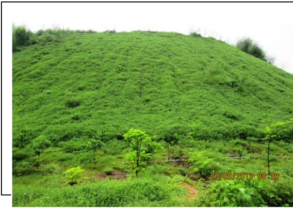
Fig.4 Distance view of ecologically restored dump