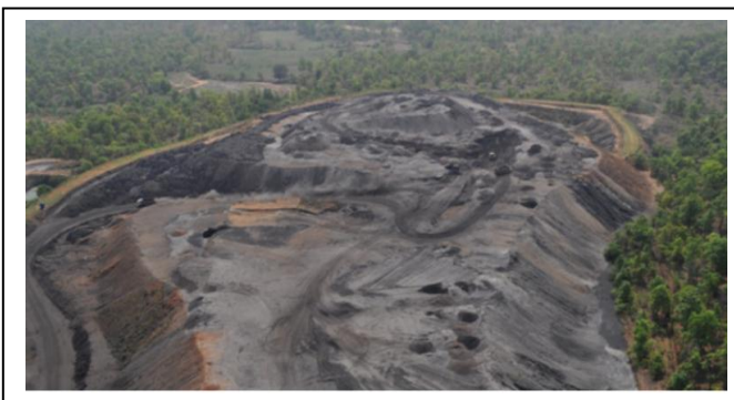
Fig.1: Aerial view of waste dump before ecological restoration

The waste dumps of an integrated sponge iron unit was located in Raigarh district, Chattisgarh, India, falls between latitudes 22°00'51"N and 22°02'10"N and longitudes 83°22'35"E and 83°23'27"E, covering an area approximately 14 ha. Wastes generated during the processes were dumped at the outskirts of plant surrounded by the Protected Forest. The height of dump ranged between 40-50 m with steep slope (> 70-80°), unstable, causing serious environmental problems. An aerial photograph of the original waste dump is shown in Fig. 1. The characteristics of waste sample are given in Table 1.