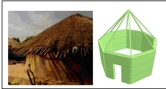
Fig. 4 (a) Zone 5 building; (b) STAAD Model