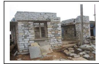
Fig. 5 (c) Rectangular Building