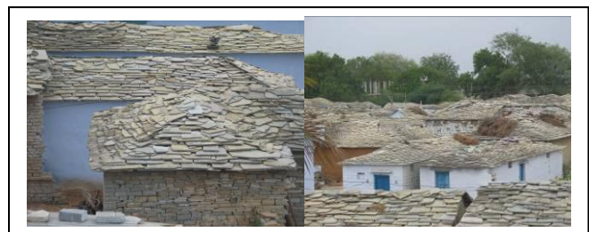
Fig. 1: (a) Stone Wall Houses; (b) Sloping Roof Top

Referring to the buildings visited in zone 2 as in Fig. 1(a) and Fig. 1(b), the skeletal model shown in Fig. 2(a) was adopted.