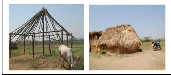
Fig. 3 (a) Skeletal Wooden Frame; (b) Thatched Roof