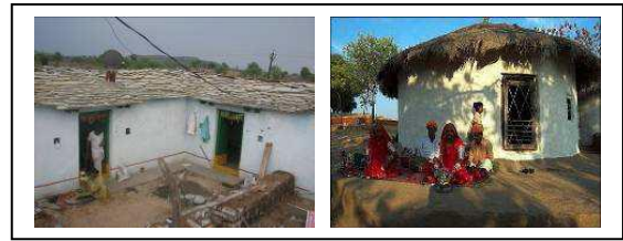
Fig. 5 (a) L-Shaped Houses; (b) Circular Houses

Under these, 3 different plans as observed in the field were chosen. They are circular, rectangular and L-shaped (shown in fig. 5 a - c)