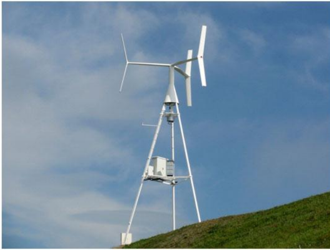
Fig.1. 20 meters high vertical axis wind turbine prototype