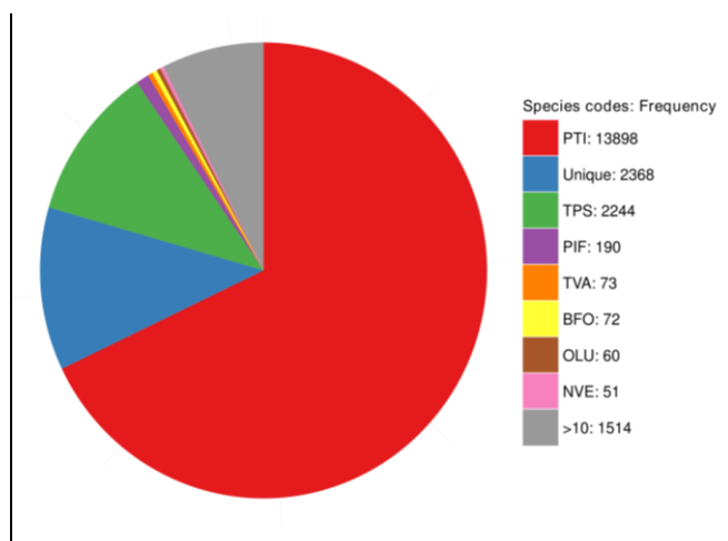
Figure 1. The species assignment of 20,470 F. solaris genes from searching the KEGG database. The species codes corresponds to the following species, in order from top to bottom: Phaeodactylum tricornutum (PTI), Thalassiosira pseudonana (TPS), Phytophthora infestans (PIF), Trichomonas vaginalis (TVA), Branchiostoma floridae (BFO), Ostreococcus lucimarinus (OLU) and Nematostella vectensis (NVE). Species with less than 10 matched genes were consolidated into one group for clarity.

An exploratory analysis was carried out to examine the difference in gene expression of F. solaris and P. tricornutum grown in low nitrogen and control conditions. We examined the difference in gene expression across species, condition and