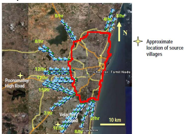
Figure 2. Movement of peri-urban groundwater towards Chennai city (Sreenivasan 2008)

Most of the agricultural wells in the peri-urban villages act as an important source of the water market, and groundwater is commercially transported through water containers called tankers. About 1200 water tankers were observed per day from the southern peri-urban villages alone and the total estimated quantity is 17.1 MLD. There are 48 packaged water companies in and around the water marketing villages, which are extracting a huge amount of groundwater and discharging the rejected water in the nearby agricultural lands without any appropriate safety measures (Packialakshmi 2011). The study conducted by Srinivasan (2008) showed that between a third and two-thirds of the water supplied to consumers was from non-utility sources.