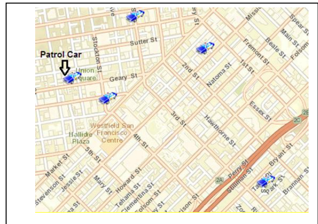
Figure 1. Dispatching of patrol cars in Abu Dhabi

As we can see, the input data of the system can be classified as big data, since it is coming from several sources, in different formats, and in real-time. The system will use Big data analytics using the tool spatial-Hadoop [15] with few operational research and optimization algorithm in order to come up with the efficient dispatching result. The result presents the number of needed patrol cars as well as their optimized locations in the city. In Fig. 1, we present the result of the dispatching system in a portion of Abu Dhabi area.